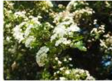
May Blossom (Hawthorn)